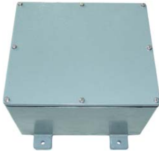
< WAB >